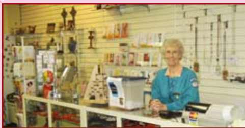
No sales tax. All proceeds benefit SVRHC Auxiliary. For more information, please call 417-3129.

From collectibles to munchies, Sierra Vista Regional Health Center's Gift Shop offers items to delight and comfort you. Operated and staffed by dedicated Auxiliary volunteers, we are pleased to offer an array of gifts for your shopping needs.